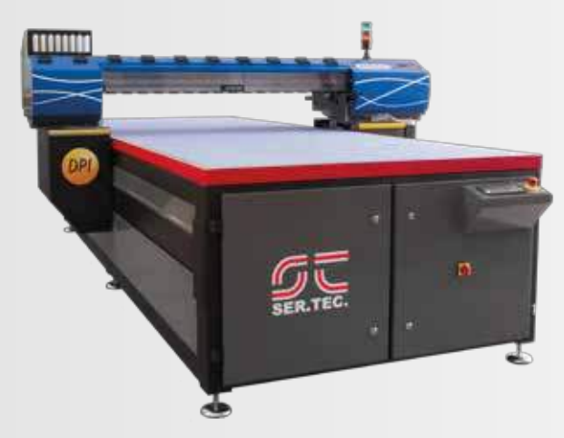
Thickness up to 250mm